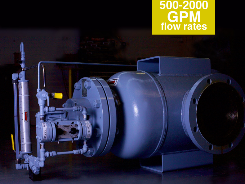
Complete, Consistent Additive Blending

Flow of the Fuel powers the Injector. NO OUTSIDE POWER SOURCE NECESSARY